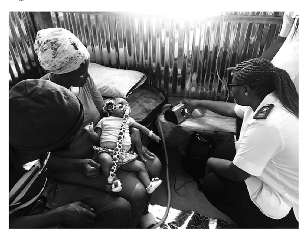
FIGURE 1 Home ventilation is feasible in low-resource settings irrespective of formal or informal household environments. Basic sanitation and reliable sources of uninterrupted electricity are the essential prerequisites. In this photo, a professional nurse assists a family living in informal housing to modify their household layout for their infant discharged home on long-term noninvasive ventilation.