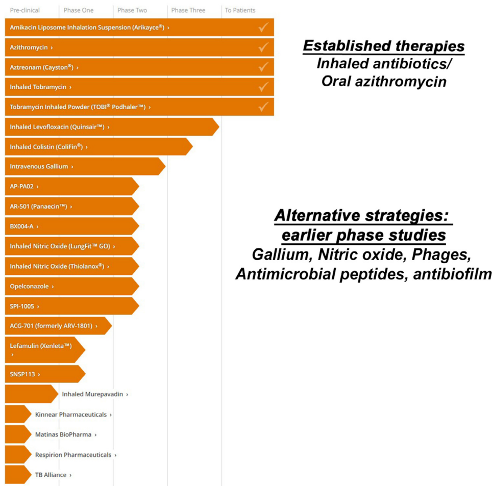
Fig.3. The antimicrobial compounds in the CF therapeutic development pipeline as of October 2022 (adapted from CF Foundation website).

vantageous features such as self-amplification at the site of infection or the capacity to disrupt biofilm matrix. Their high host specificity makes them very promising tools for targeted and personalised anti-infective therapy. Anecdotal reports described interesting effects of inhaled or intravenous bacteriophages in pwCF who developed infections with untreatable M. abscessus [91,92], pan-drug resistant A. xylosoxidans [93] or P. aeruginosa [94]. Phage cocktails (ready-to-use, or “magistral”, customized preparations [95]) have been produced by several laboratories worldwide, and early phase clinical trials on the phage therapy of P. aeruginosa in CF have been designed. Compassionate use of bacteriophages is also ongoing in multiple countries. Yet many questions remain unanswered, including how to test the efficacy of phage therapy for pwCF both in vitro and in vivo , how to select phage cocktails, how to combine phages with antibiotics, and how best to deliver phages to CF airways [96,97].